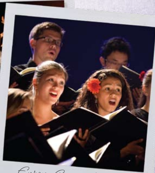
Europa Cantat Festival Utrecht, Netherlands