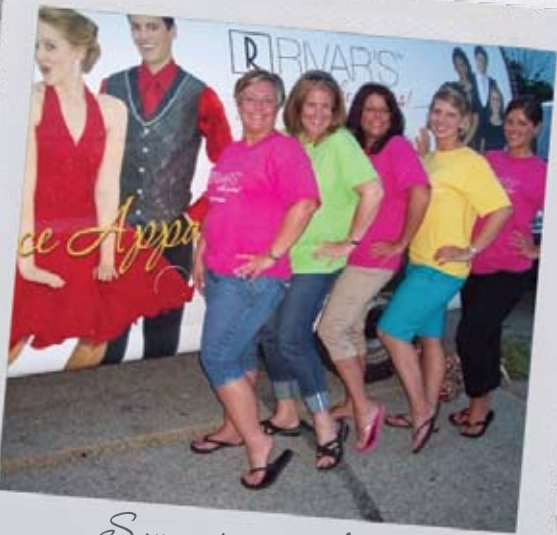
Summer camp fun! Rivar's sales force strikes a pose!